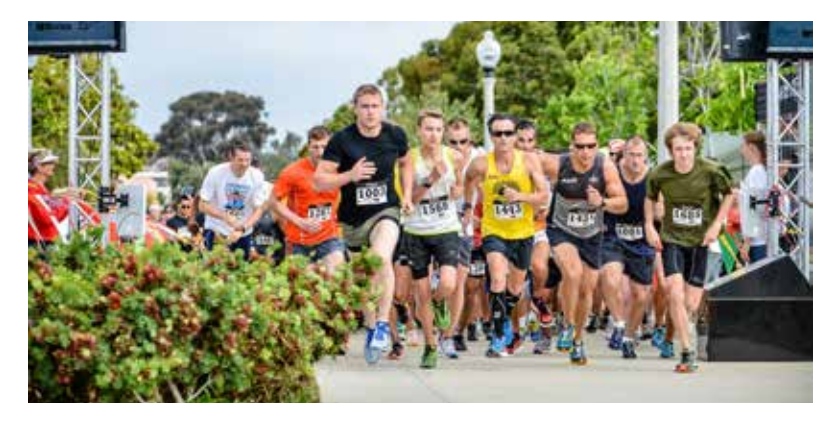
More than 700 participants of all ages took part in the first EOD Warrior 5K in San Diego, CA, raising more than $35,000.

From bike ride and runs, plunges, golf tournaments and special dining events, the number of fundraising events and activities benefitting the Foundation continues to grow, raising almost $500,000 in 2013. Thank you to the many individuals and organizations, sponsors and participants in communities around the country who helped raise critical financial support and awareness in their communities for the EOD Warrior Foundation.