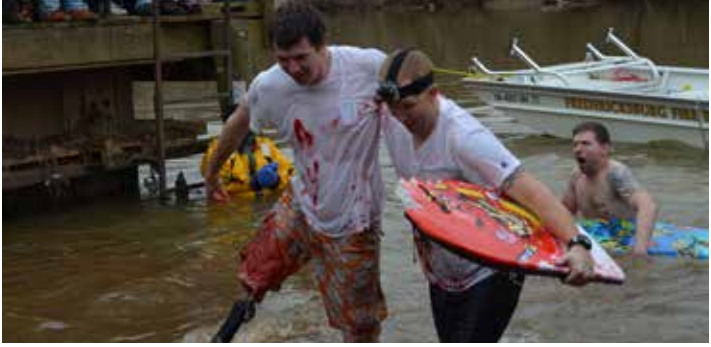
The 7th Annual Polar Bear Plunge saw more than 200 plungers of all ages and raised over $30,000.

With our Ambassador team growing to over 20 Ambassadors across the United States in 2014, it's no surprise that our fundraising events raised over $800,000. In addition to our Ambassadors, EOD families and friends around the world hosted unique events benefitting the EOD Warrior Foundation. We could not complete our mission without the tremendous support we receive, and with this incredible community behind us we continue to raise critical financial support and awareness for these deserving military warriors and their families.