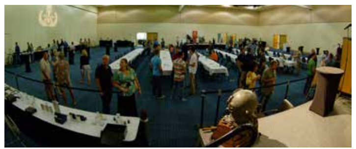
The EOD Auction was a fun night for all, reuniting EOD friends from across the globe and raising over $116,000.